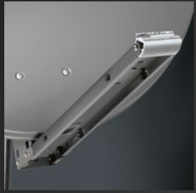
STAR LINE ALU 85