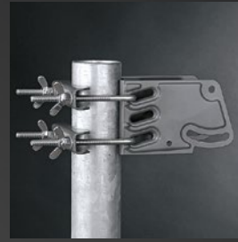
STAR LINE ALU 85