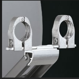
STAR LINE ALU 85 multifeed support (otional)