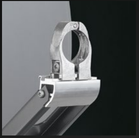
STAR LINE ALU 85